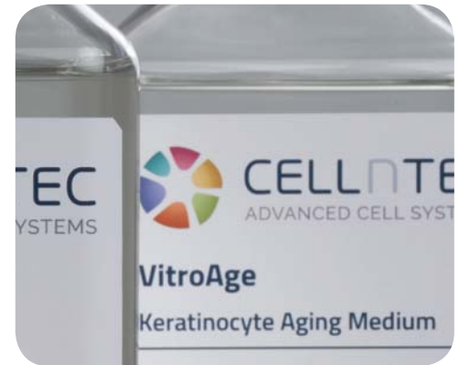
The VitroAge medium (CnT-AG2) encourages keratinocyte aging, without the need for chemical treatments.

To address this weakness, we developed the VitroAge medium. VitroAge retains basic metabolic and structural components (such as amino acids) at standard levels, whilst reducing the concentrations of other protective components.